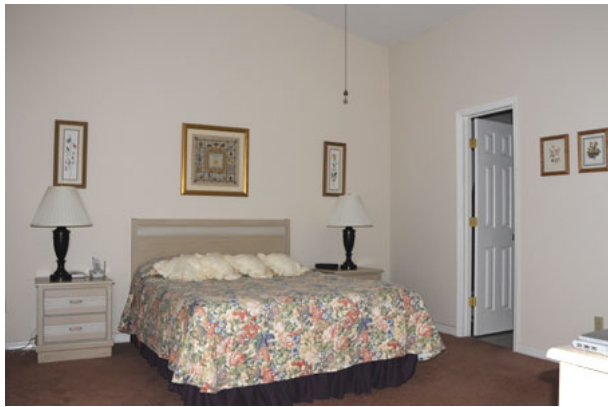
The master bedroom, with en-suite bathroom, walk-in closet and sliding doors to the porch and deck.