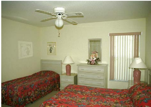
The second bedroom with both a full size and a twin bed.

A third has twin beds and vanity unit, whilst a queen size pull-out in the lounge, provides additional sleeping accommodation. The kitchen with its breakfast area, is fully equipped with all modern conveniences including large fridge-freezer with ice-maker, cooker, microwave oven, dishwasher, coffee maker, waste disposal unit and all the necessary utensils and crockery. A laundry room with washing machine and tumble drier leads to the integral double garage.